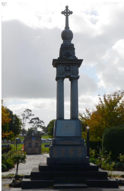
Mount Gambier War Memorial